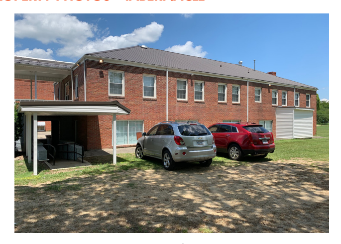
Exterior Side View