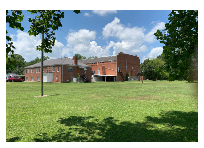
Exterior Back View