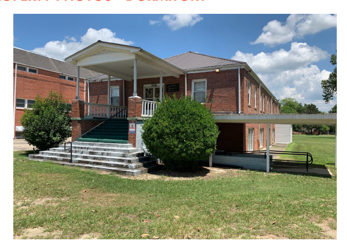
Exterior Front View