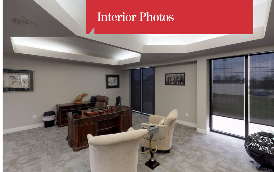
2nd Floor Office