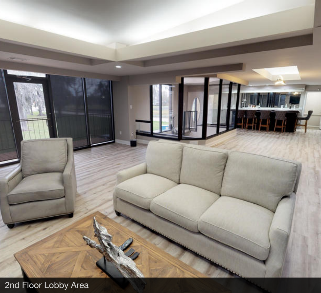
2nd Floor Lobby Area