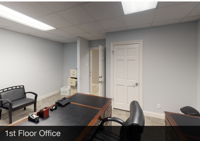
1st Floor Office