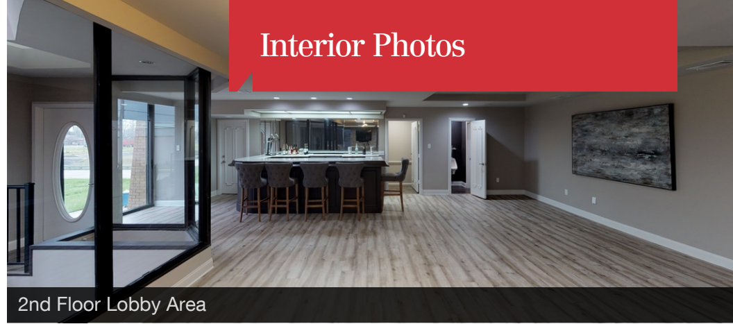
2nd Floor Lobby Area