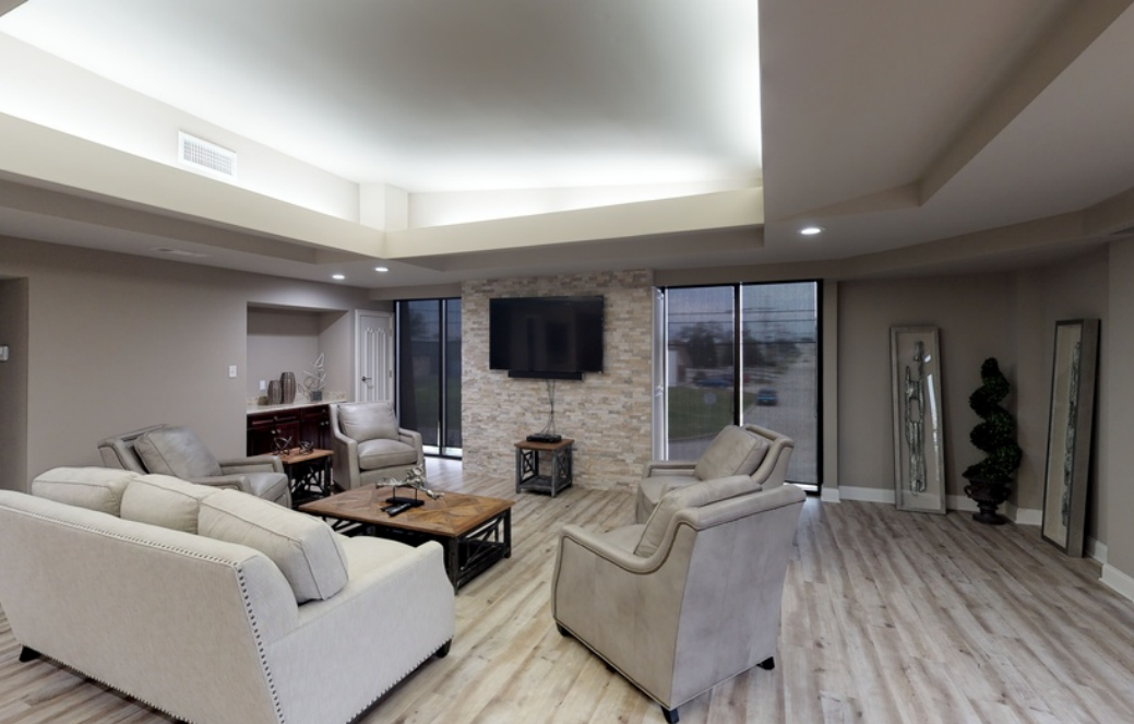
2nd Floor Living Area