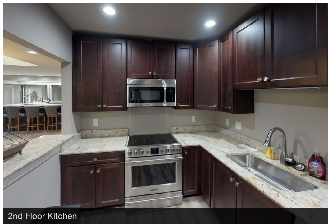
2nd Floor Kitchen