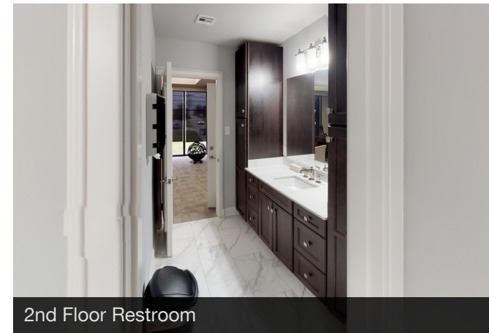
2nd Floor Restroom