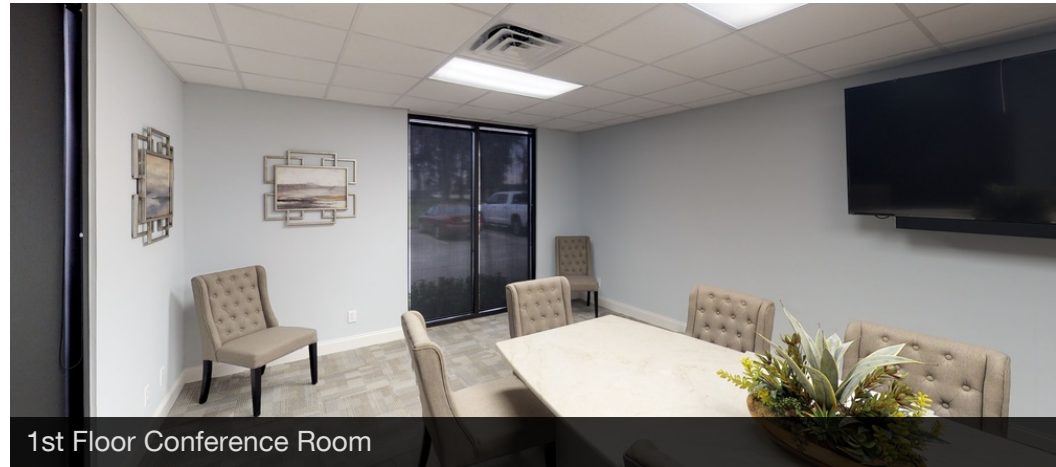
1st Floor Conference Room