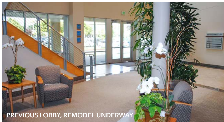
PREVIOUS LOBBY, REMODEL UNDERWAY