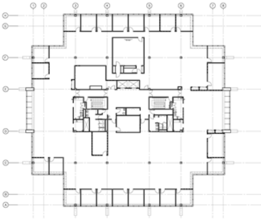
4th Floor "As-Built" | 19,400 SF