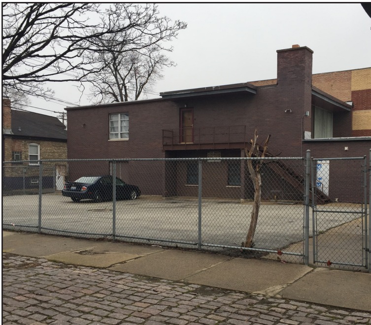
Parking Lot and Second Floor Apartment