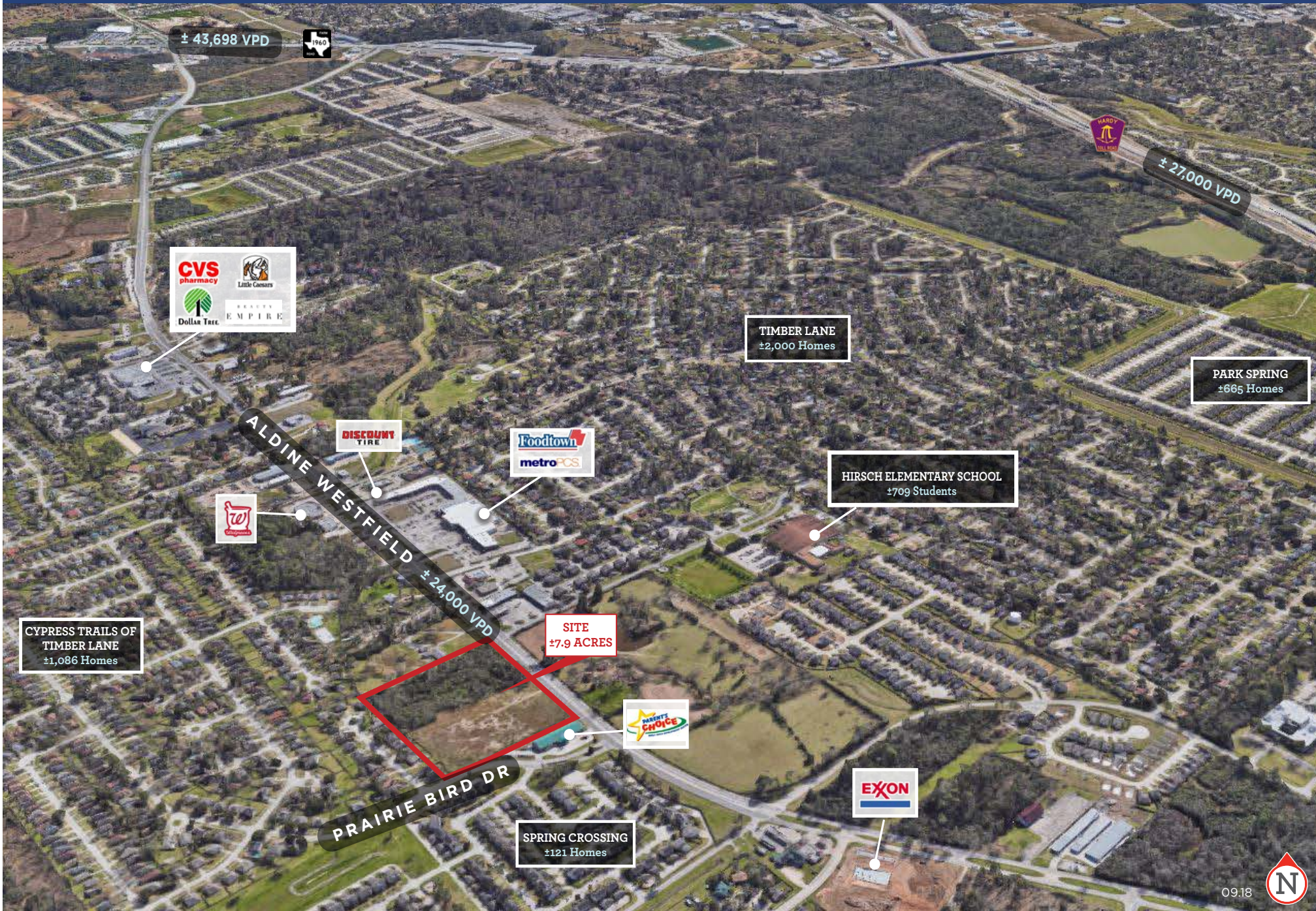
7.9 Acres - Aldine Westfield