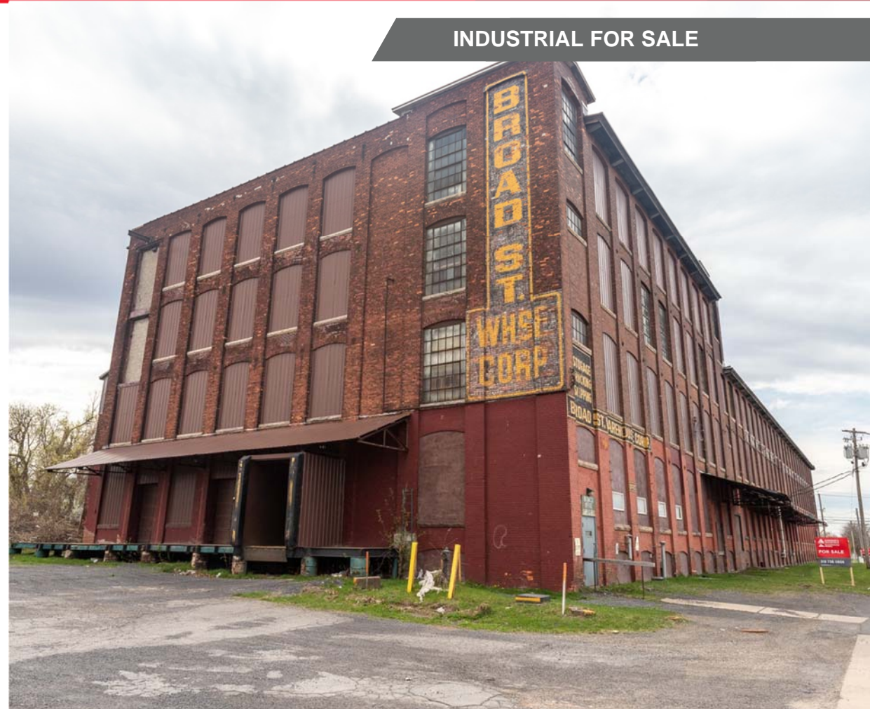
INDUSTRIAL FOR SALE