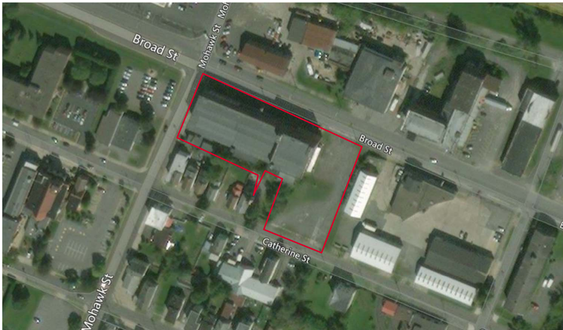
Approximate Plot Lines, Subject to Verification of Survey City of Utica, NY Tax ID's 319.9-2-17.1, 17.2, 26.0 & 27.0