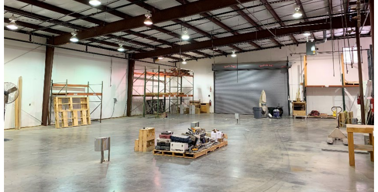
MINIMUM 17' CLEAR HEIGHT