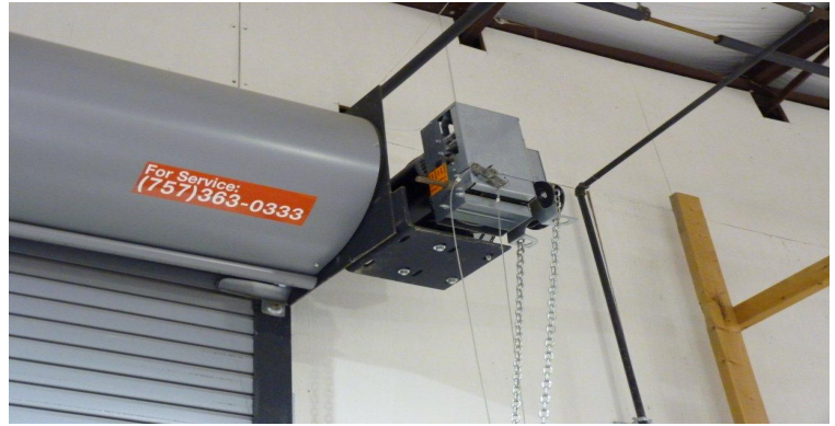
OVERHEAD DOOR ELECTRICAL OPENER