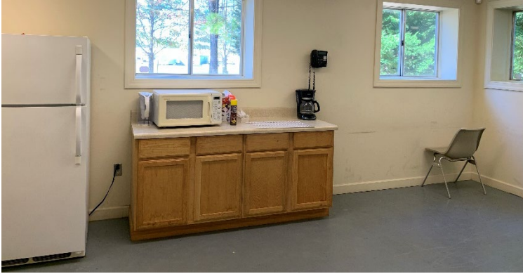
KITCHEN – EMPLOYEE BREAKROOM