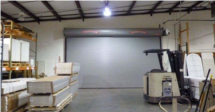
OVERHEAD DOOR – 12'H X 20' W