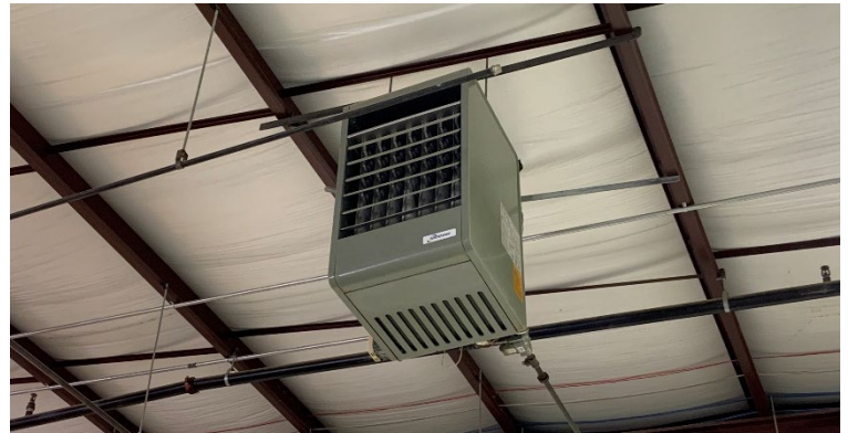
WAREHOUSE GAS HEAT