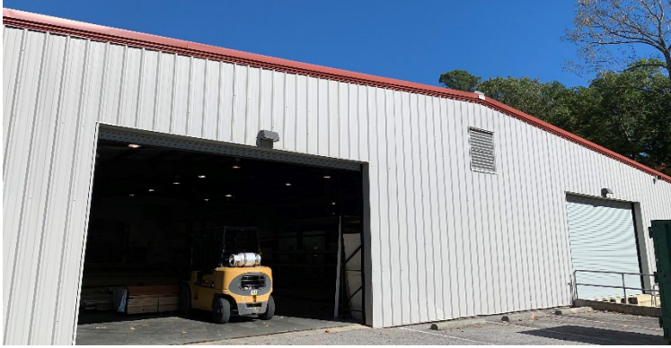
GRADE AND DOCK LEVEL