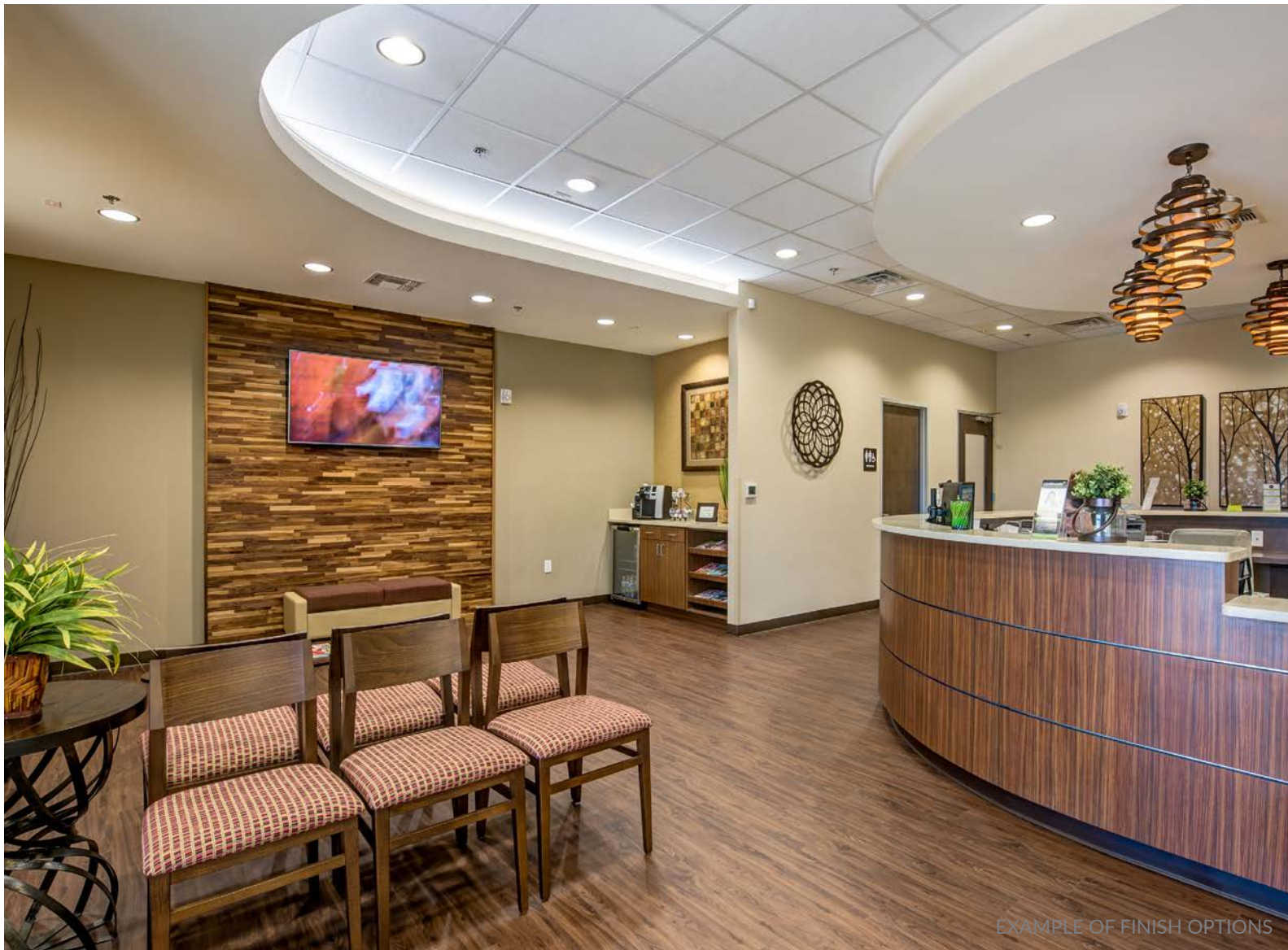
EXAMPLE OF FINISH OPTIONS