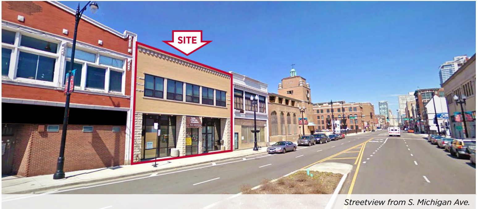
Streetview from S. Michigan Ave.

2416 S. Michigan Avenue CHICAGO, IL 60616