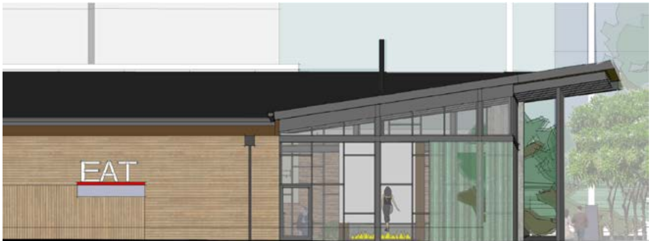
South elevation conceptual rendering