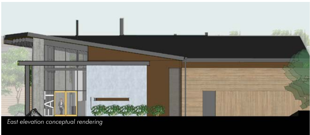
East elevation conceptual rendering

— New Kenmore Town Green to be built next to the retail pad