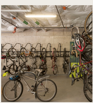
1501 E. Madison, Seattle, WA 98122