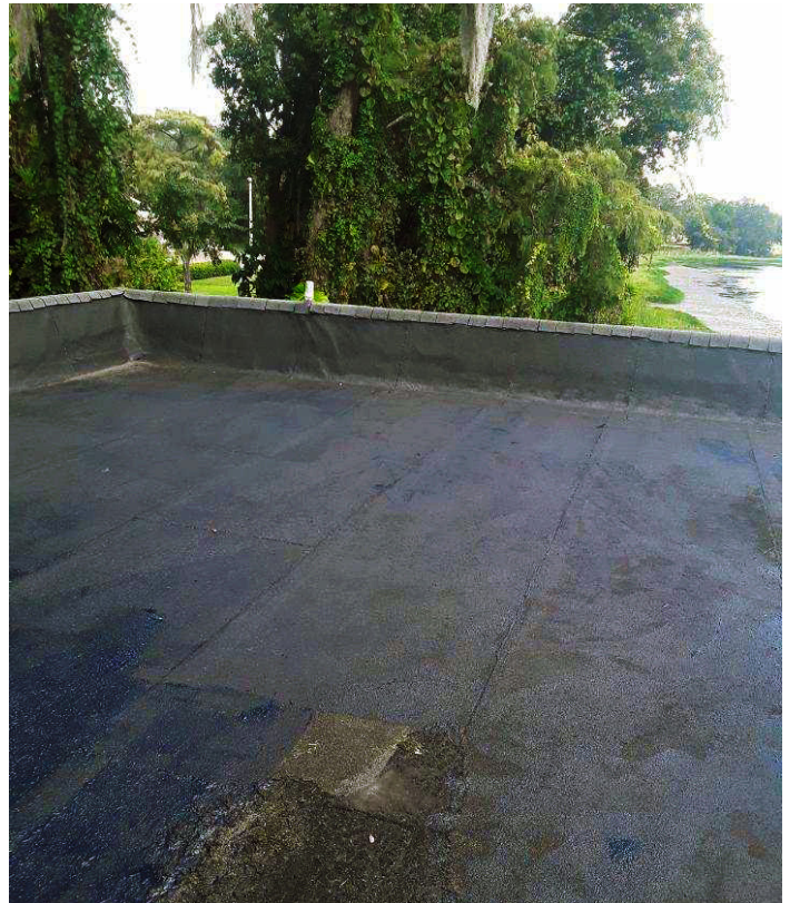
Newly sealed roof