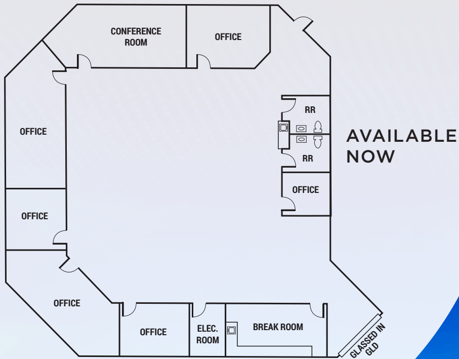
(Floorplan Not to Scale)