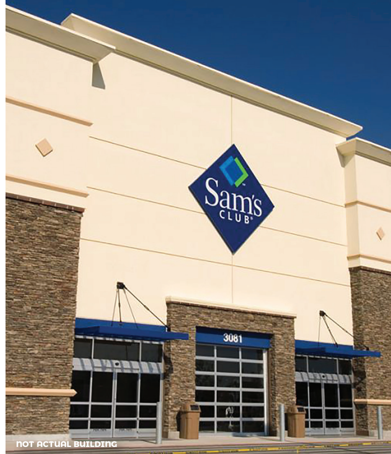
NOT ACTUAL BUILDING