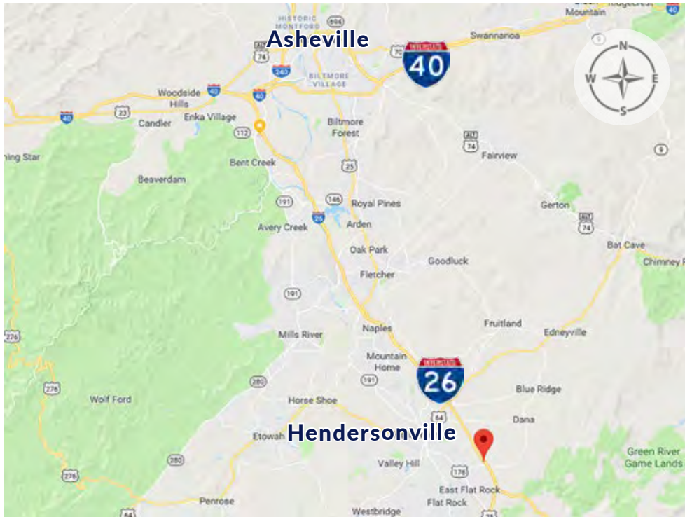
Flat Rock, NC is 4.1 miles from Hendersonville, and 27.6 miles from Asheville

Upward Crossing Drive, Flat Rock, NC 28731