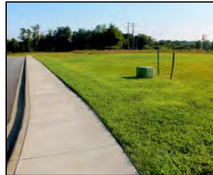
Upward Crossing Drive sidewalk in place