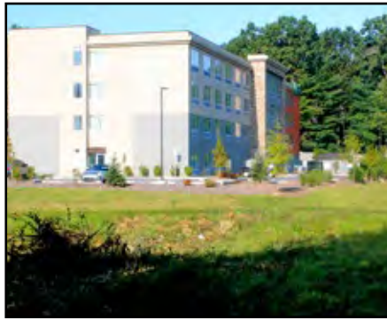
Adjacent to Holiday Inn Express & Suites