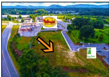
Aerials from different angles