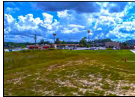
View south, toward businesses on Upward Rd

Located in an Opportunity Zone, a community tool established by Congress in the Tax Cuts and Jobs Act of 2017