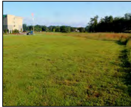
View north, toward Holiday Inn Express