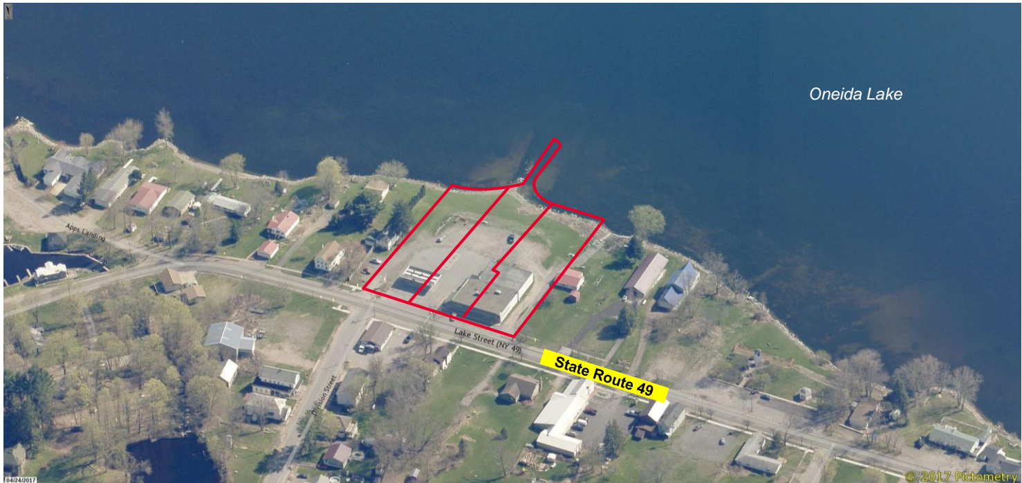
View of Property Looking South

Sale Includes three Tax Parcels: 313.13-07-11, 313.13-07-12 and 313.13-07-13