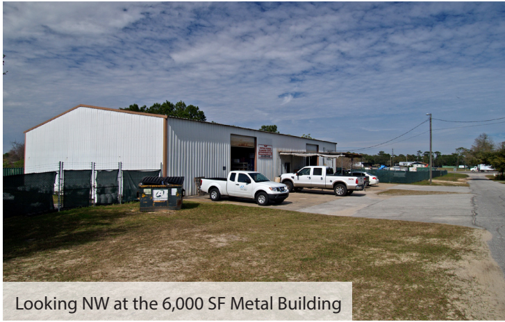
Looking NW at the 6,000 SF Metal Building