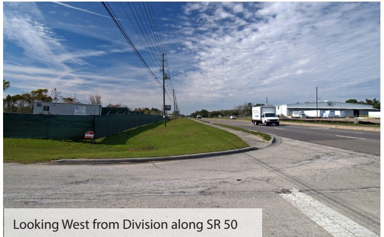
Looking West from Division along SR 50