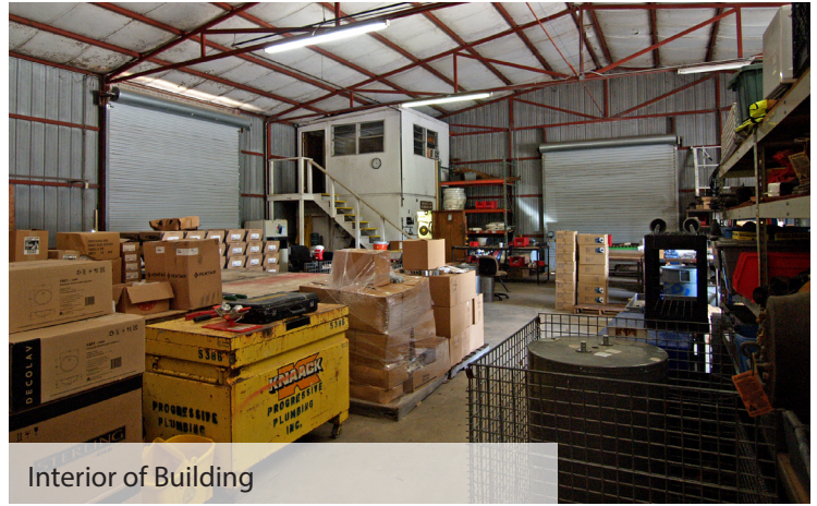
Interior of Building