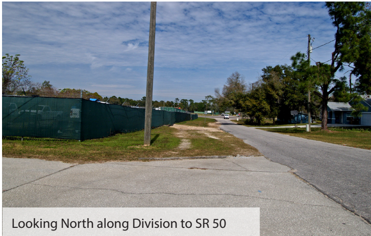
Looking North along Division to SR 50