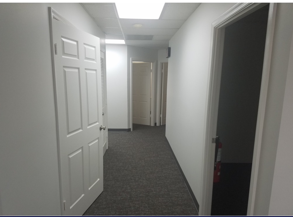
4312 Evergreen Lane, Suites A & C Annandale, VA 22003