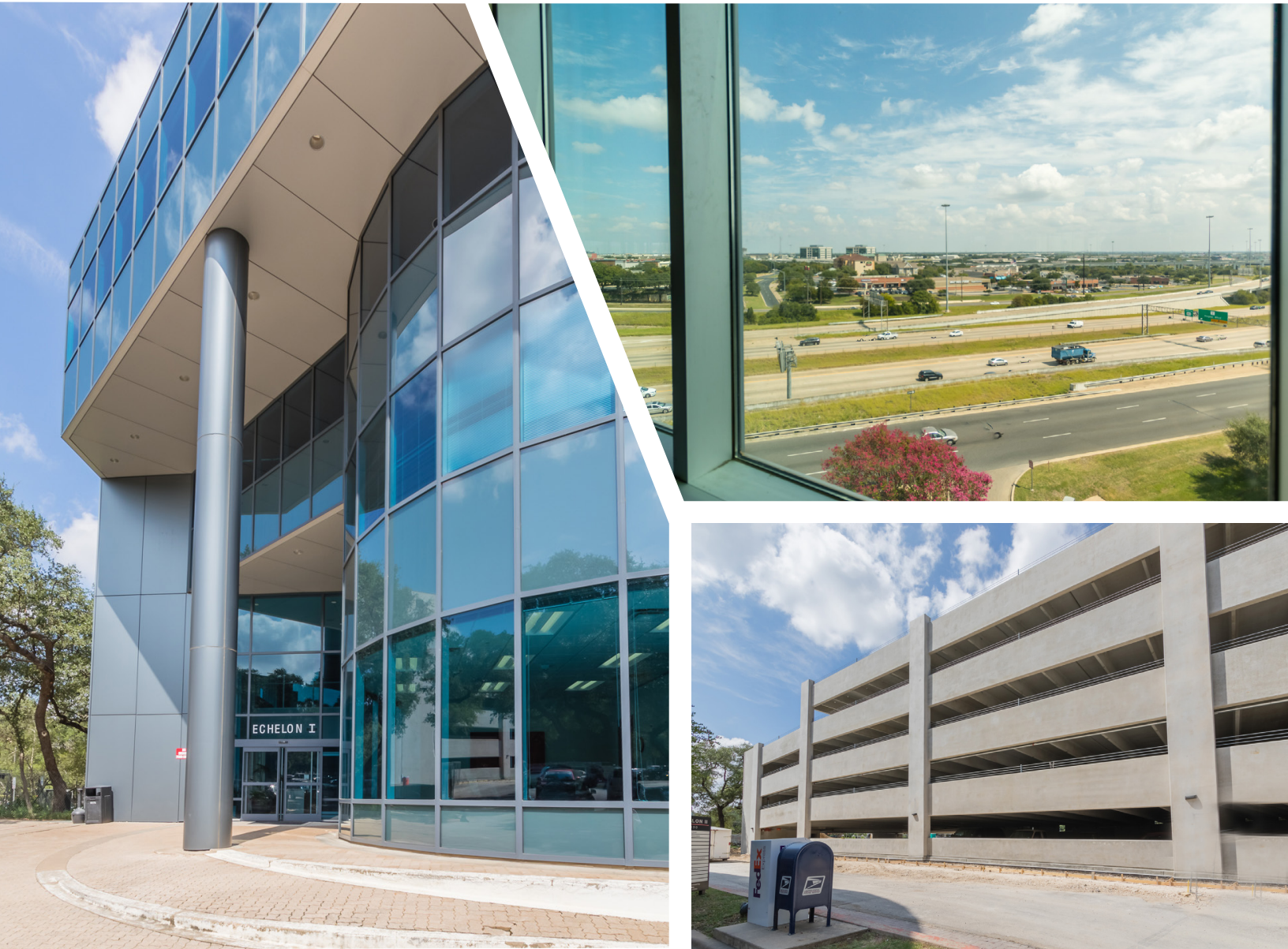
Left, top, bottom: Exterior, view from 4th floor, parking garage with 4.5:1000 parking

9430 RESEARCH BOULEVARD • AUSTIN, TEXAS 78759