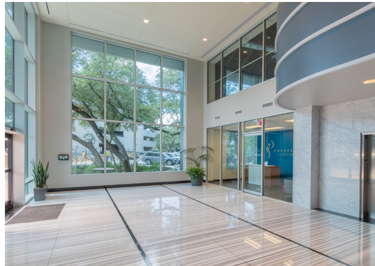
Top, left, right: Views from 4th floor, lobby from 2nd floor, lobby