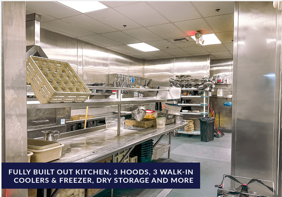
FULLY BUILT OUT KITCHEN, 3 HOODS, 3 WALK-IN COOLERS & FREEZER, DRY STORAGE AND MORE