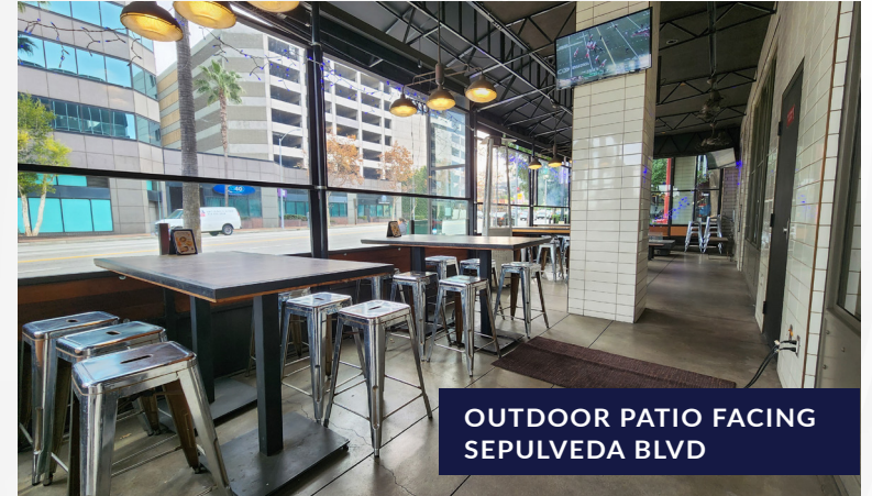
OUTDOOR PATIO FACING SEPULVEDA BLVD