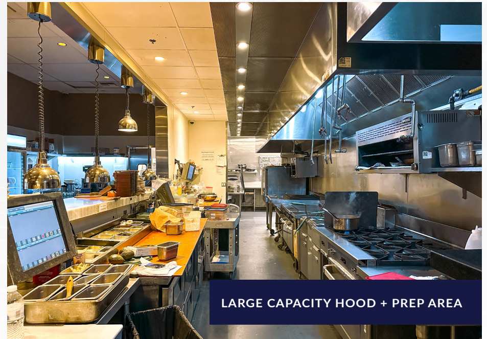
LARGE CAPACITY HOOD + PREP AREA