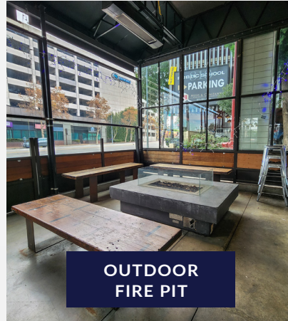
OUTDOOR FIRE PIT