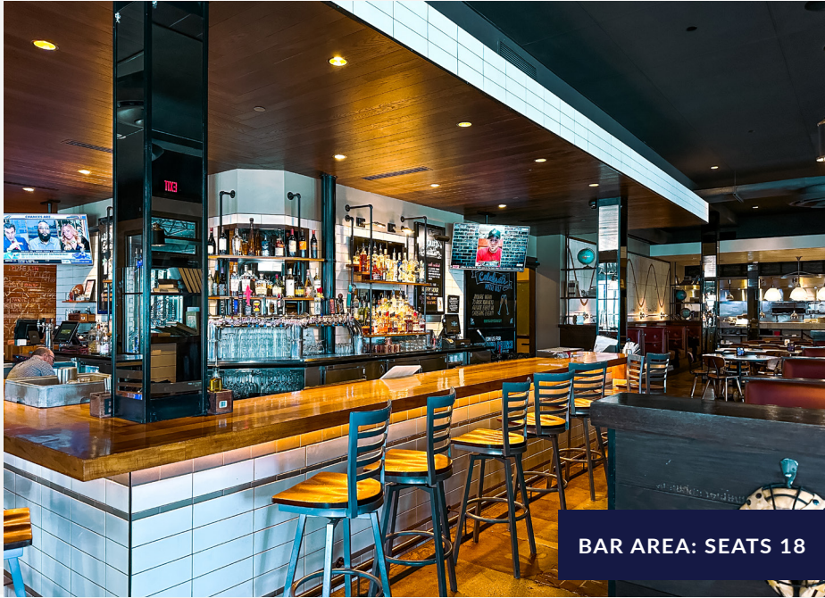
BAR AREA: SEATS 18