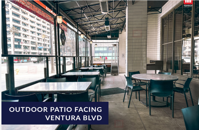
OUTDOOR PATIO FACING VENTURA BLVD