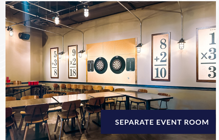
SEPARATE EVENT ROOM