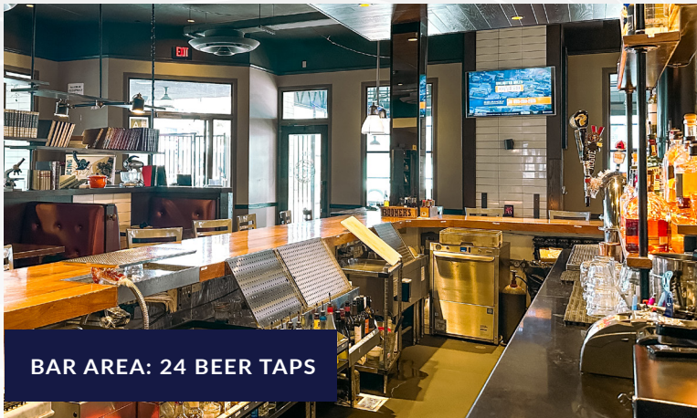
BAR AREA: 24 BEER TAPS