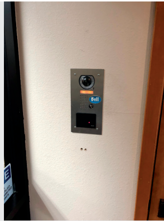
Security and Card Access System

For Sale or Lease W6272 Communication Court Appleton, WI.