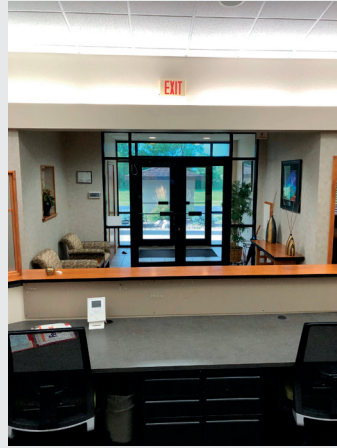
View From Reception Desk