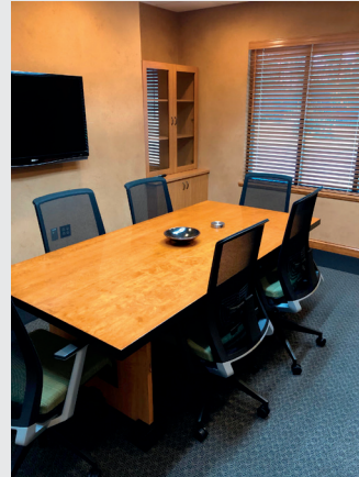
Conference Room B