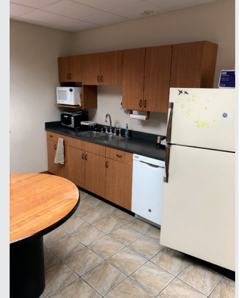
Break Room Equipped with Dishwasher and Garbage Disposal

• In-floor radiant heat in portion of building