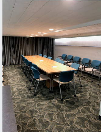
Lower Level Conference Room