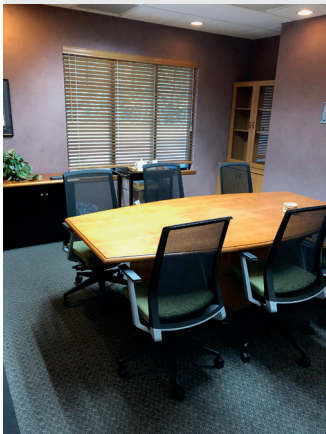
Conference Room A