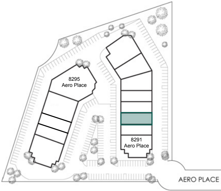
8291 Aero Place, Suite 120