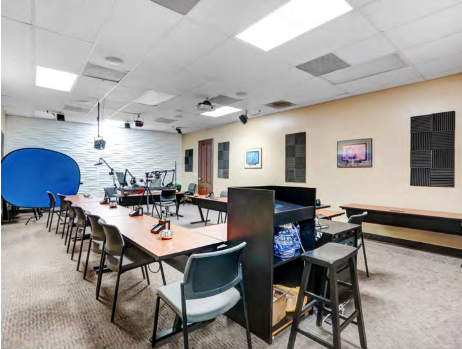
State of the Art Conference Room