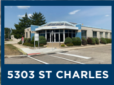
5303 ST CHARLES