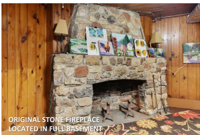
ORIGINAL STONE FIREPLACE LOCATED IN FULL BASEMENT