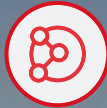
3D Tour - 1 Bed / 1 Bath