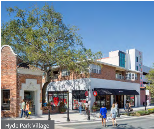
Hyde Park Village