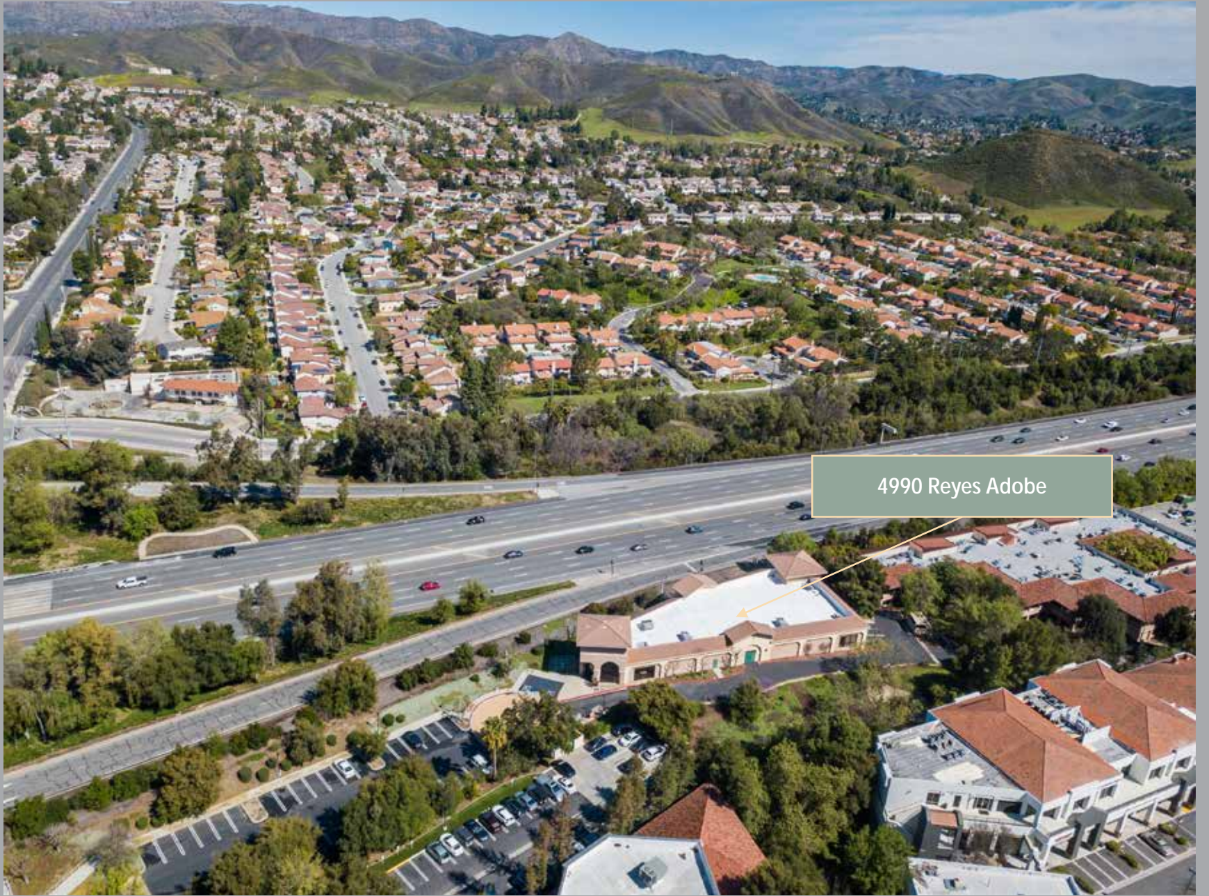
4990 Reyes Adobe