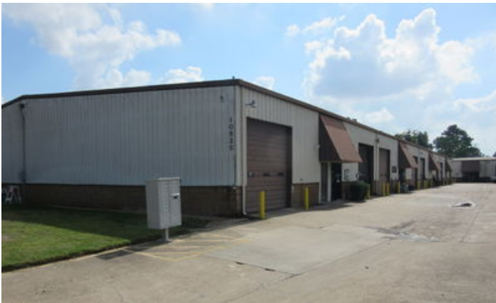
5a8df58b2f56e900012cada0_Barely Business Park