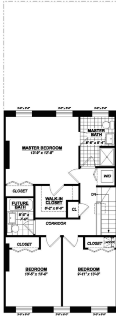
3 rd Floor (Proposed) 817 sf