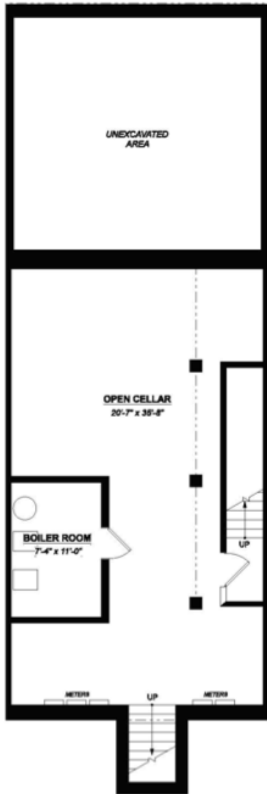
Basement (Existing) 1,263 sf