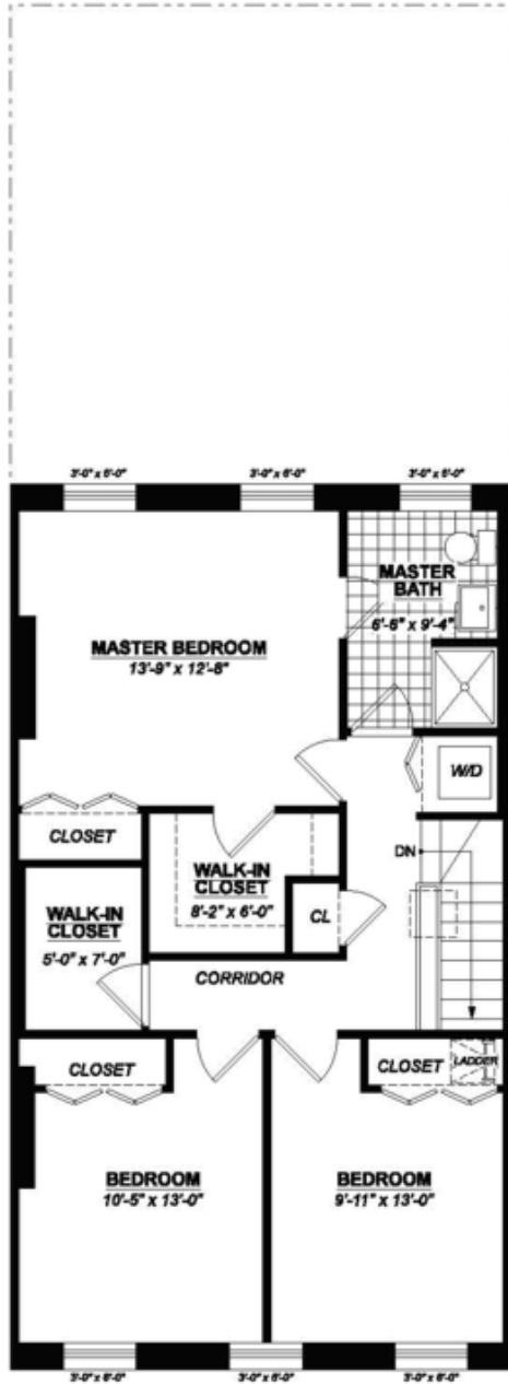
3 rd Floor (Existing) 817sf