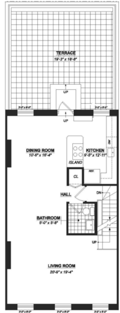
2nd Floor (Existing) 817 sf