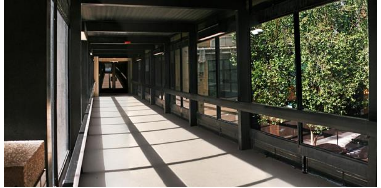
WALKWAY TO PARKING GARAGE