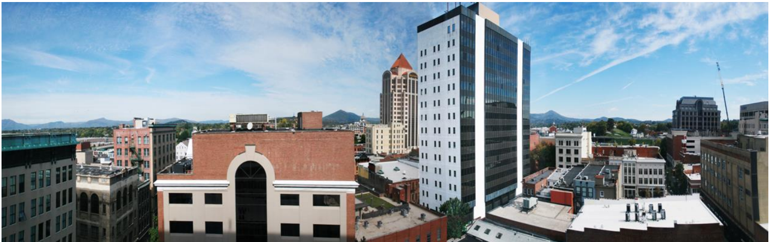
VIEW FROM OFFICE SUITE