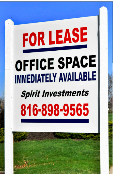
Well Maintained / Locally Owned

FOR LEASE OFFICE SPACE IMMEDIATELY AVAILABLE Spirit Investments 816-898-9565