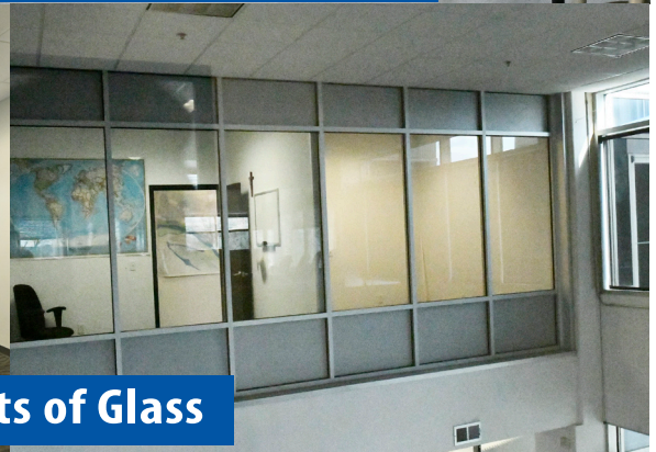
Inner Offices Include Lots of Glass

Call 816-898-9565 for More Info - 6300 Equitable Rd., Kansas City, MO 64120