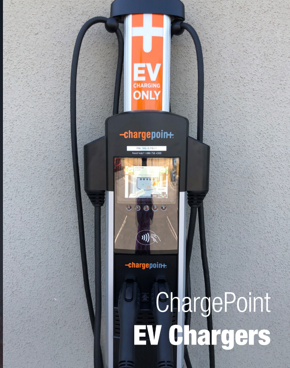
ChargePoint EV Chargers