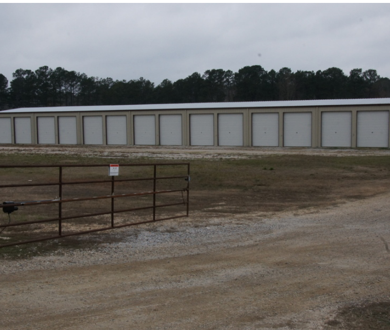
Building 3: 9,450 SF