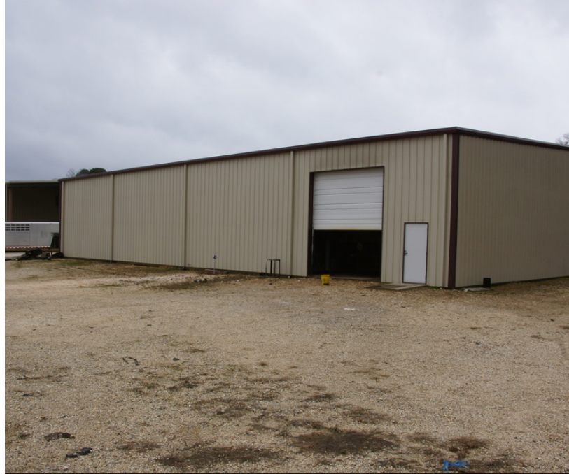
Building 2: 10,000 SF