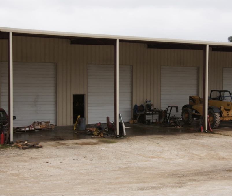
Building 1: 6,00 SF + 5,500 SF Canopy