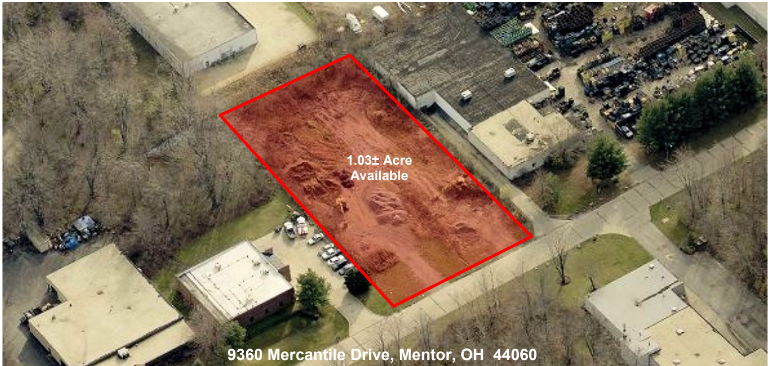
9360 Mercantile Drive, Mentor, OH 44060