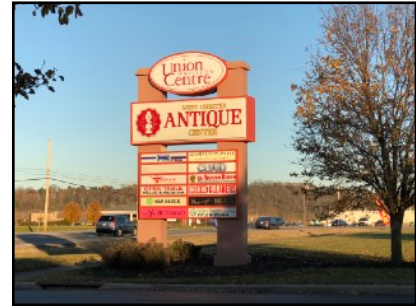
Outparcel available also for sale ($350,000/acre)