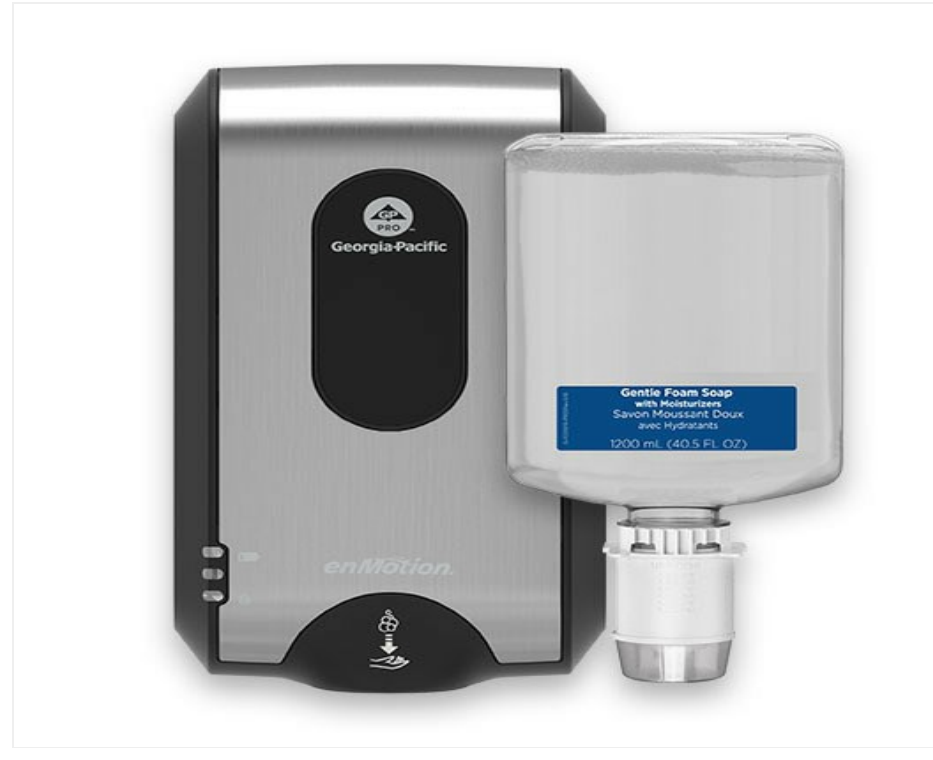
Hands Free Soap Dispensers in all bathrooms