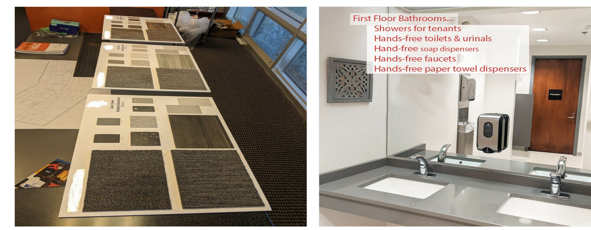
Three Color Palette options to choice from