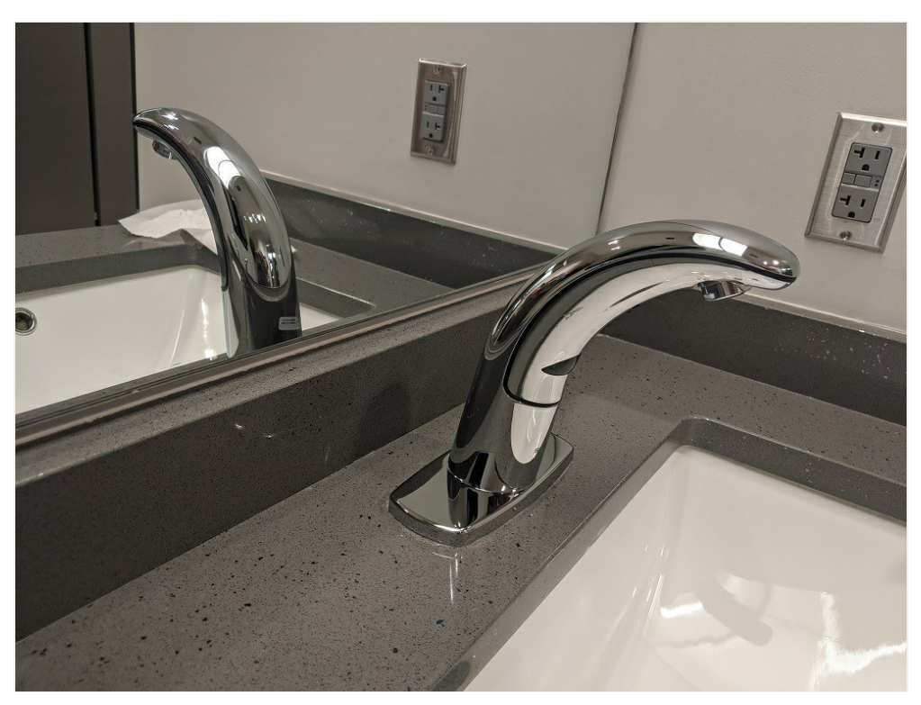
Hands-free faucets in the common area bathrooms