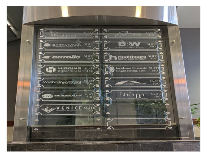
Deer Creek Tenant Directory