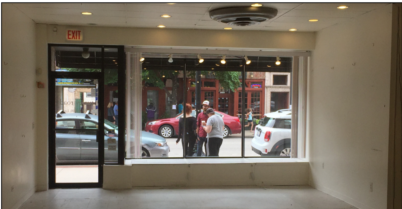
Large Windows on Clark St.