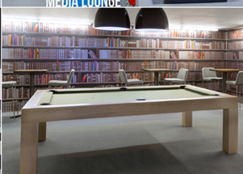
REC ROOM W/ BILLIARDS