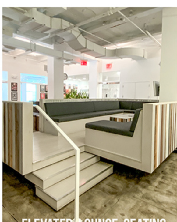
ELEVATED LOUNGE SEATING