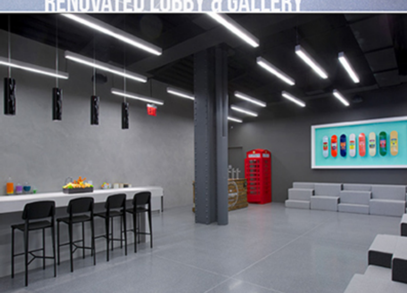
COFFEE BAR, PANTRY & LOUNGE