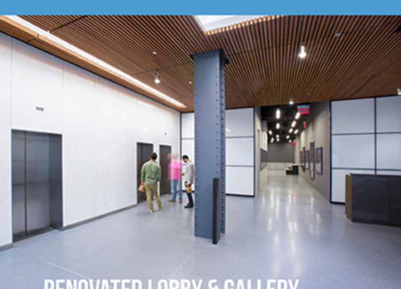
RENOVATED LOBBY & GALLERY