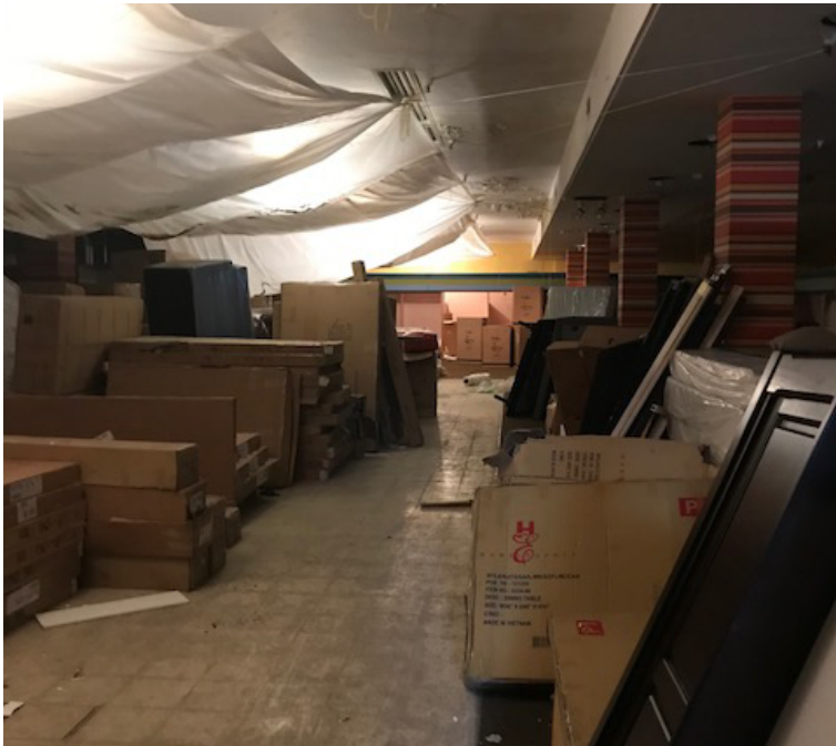
Upper Floor Storage