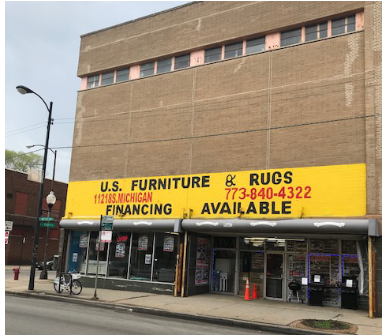
Michigan Ave Facade