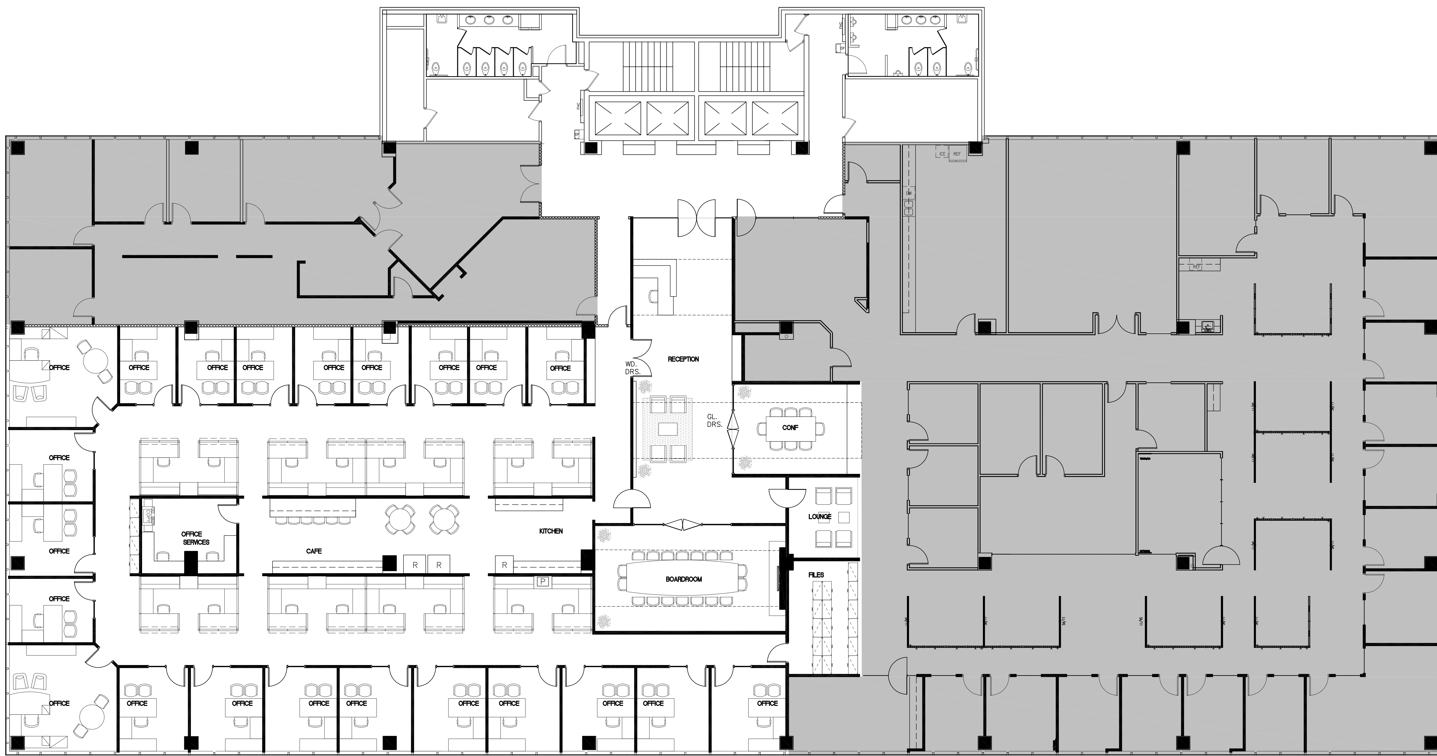
1 10TH FLOOR SPACE PLAN ID-100.31 SCALE: 1/8" = 1'-0"