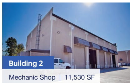
Building 2 Mechanic Shop | 11,530 SF