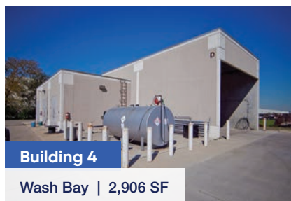
Building 4 Wash Bay | 2,906 SF