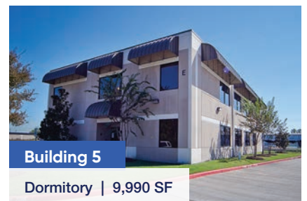
Building 5 Dormitory | 9,990 SF