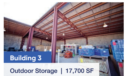
Building 3 Outdoor Storage | 17,700 SF