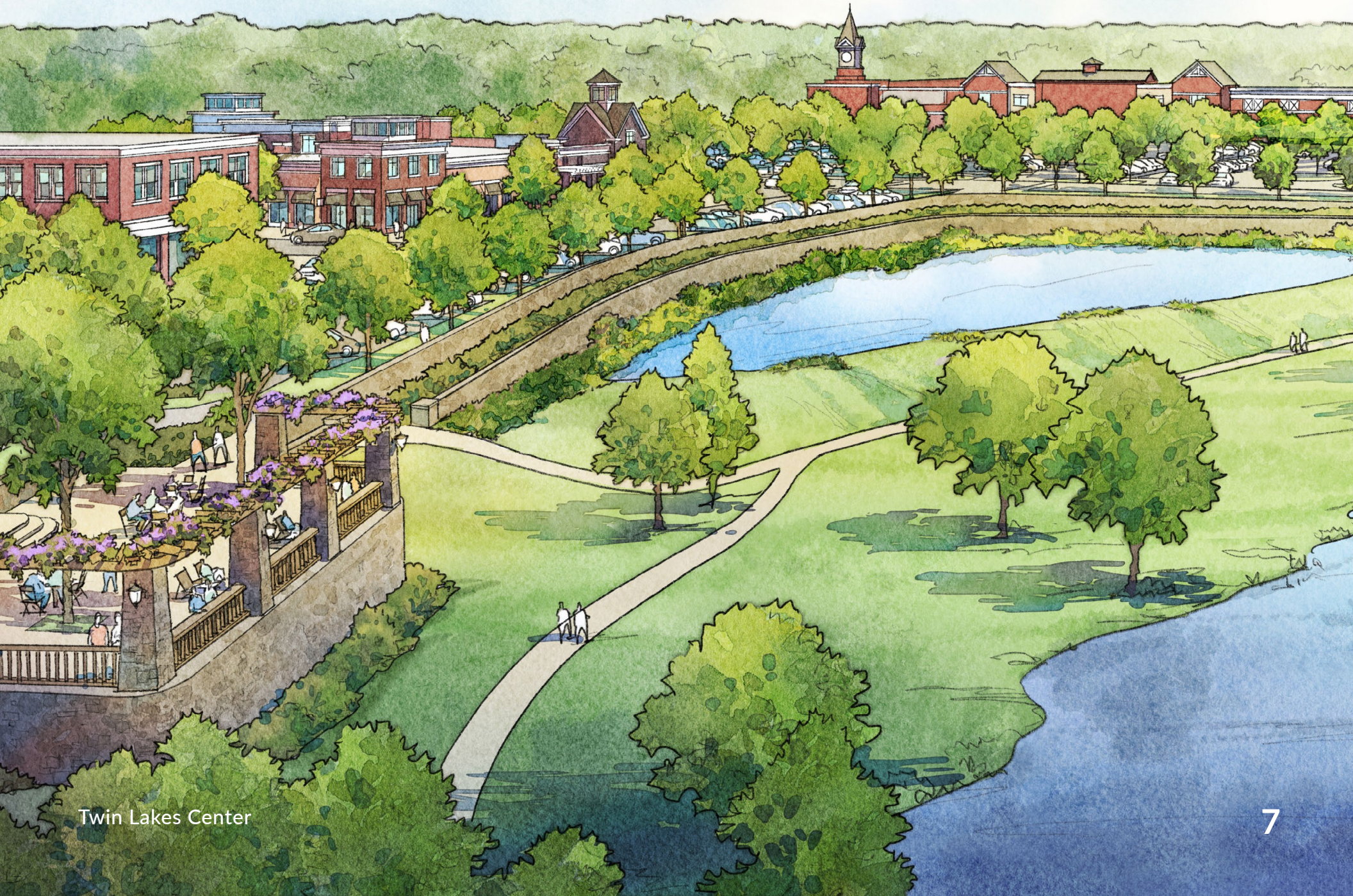
Twin Lakes Center