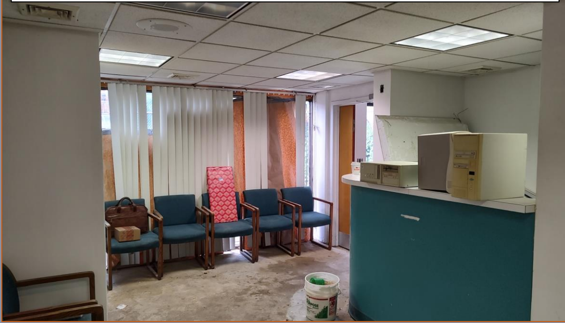
Private entrance with Independent reception/waiting.