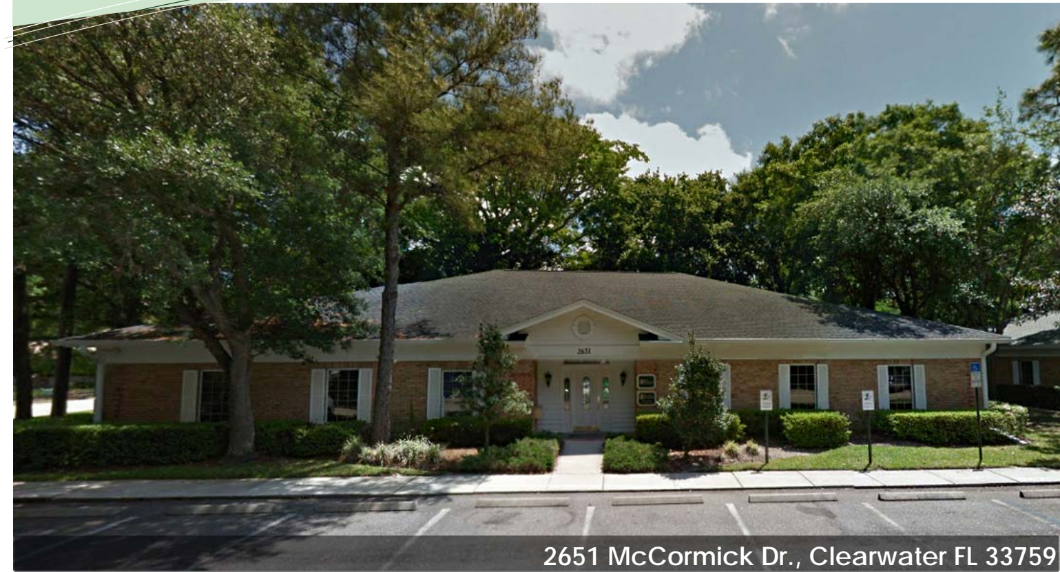
2651 McCormick Dr., Clearwater FL 33759