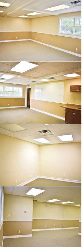
SUITE 202 | 1,500± SF