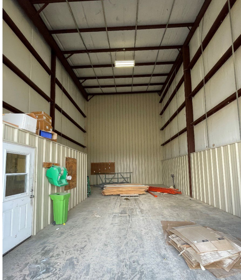
Parts/Storage Bay with Mini Office