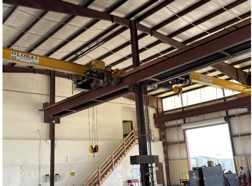
Two 10-Ton Cranes