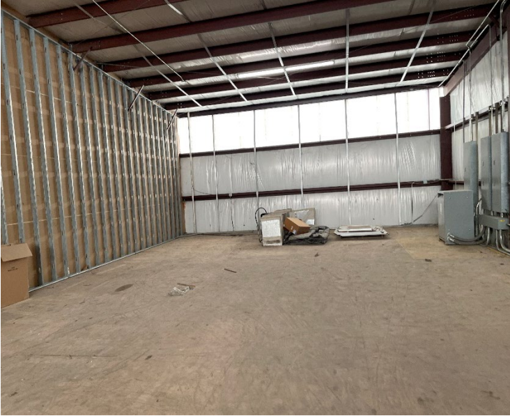
2 nd Floor Mezzanine Storage