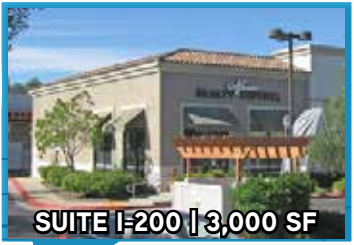
SUITE I-200 | 3,000 SF