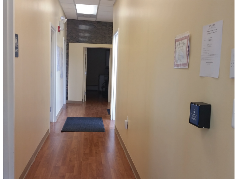
Well Lit Hallway