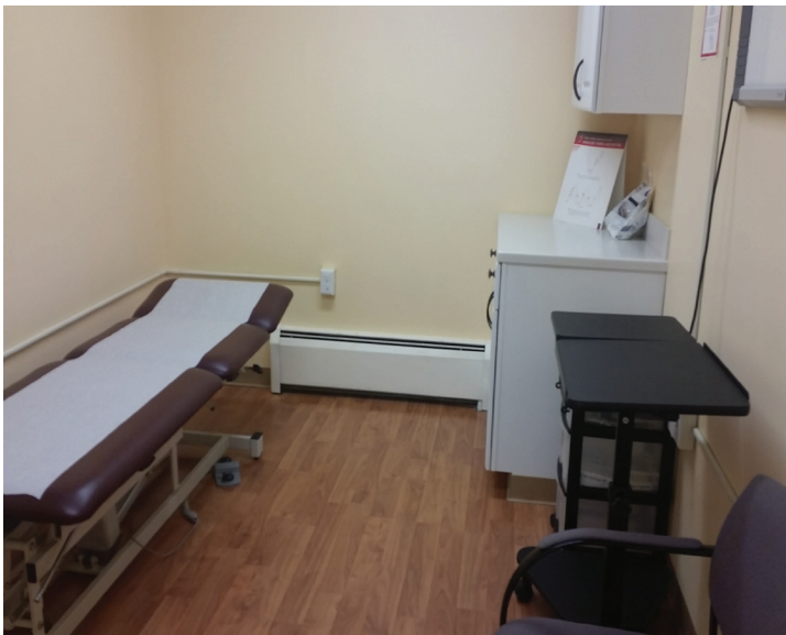
Modern Exam Rooms