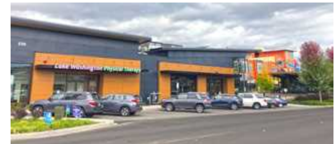
Lake Washington Physical Therapy