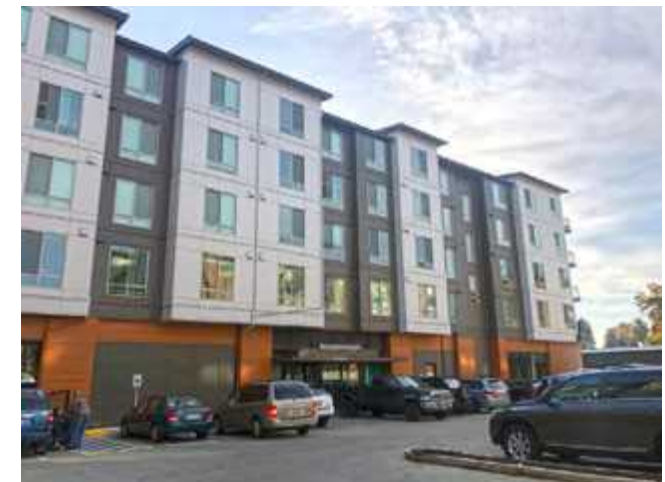
EvergreenHealth Primary Care